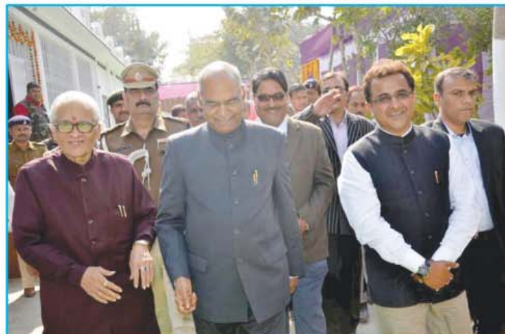
Hon'ble His Excellency Shri Ram Nath Kovind Ji visiting the campus on the eve of Annual Day Celebration, February 2016

Spread over a majestic six acres of land with the total built - up area of 60,000 Sq. ft, L. N. Mishra College of Business Management, Muzaffarpur, was established in 1973. For more than four decades, the College established itself as a centre of excellence imparting professional courses. The College has lush green eco-friendly campus, solar energy, wi-fi connectivity and state of the art infrastructures. The campus is under CCTV surveillance with 24 x 7 security.